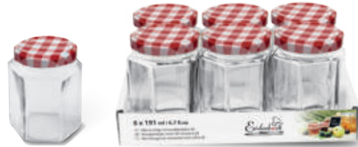
content: 6 pcs.* volume: 191 ml (6.7 fl.oz) shape: hexagonal diameter: TO 58