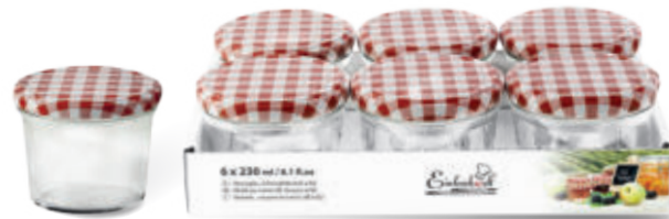
content: 6 pcs.* volume: 230 ml (8.1 fl.oz) shape: mold diameter: TO 82