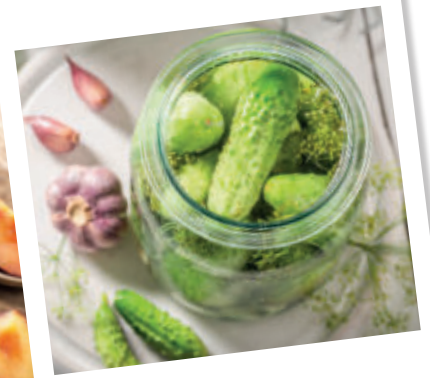
Classic: pickled cucumber