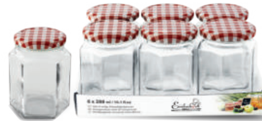
content: 6 pcs.* volume: 288 ml (10.1 fl.oz) shape: hexagonal diameter: TO 63