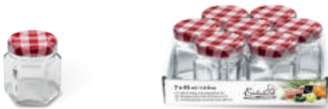
content: 12 pcs.* volume: 45 ml (1.6 fl.oz) shape: hexagonal diameter: TO 43