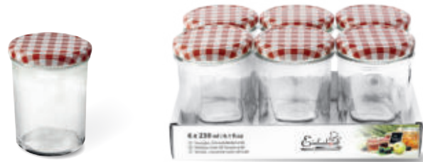
content: 6 pcs.* volume: 230 ml (8.1 fl.oz) shape: mold diameter: TO 66